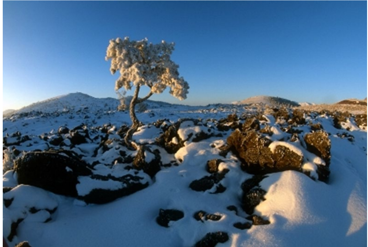
Craters of the Moon National Monument & Preserve United States NPS